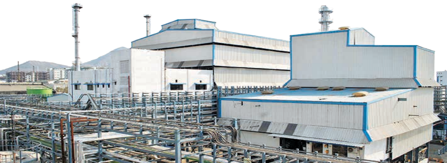
View of Ambernath Factory

Some of the statements in this management discussion and analysis describing the Company's objectives, projections, estimates and expectations may be 'forward looking statements' within the meaning of applicable laws and regulations. Actual results might differ substantially or materially from those expressed or implied. Important developments that could affect the Company's operations include a downtrend in industry, significant changes in political and economic environment in India and abroad, tax laws, import duties, litigation and labour relations.